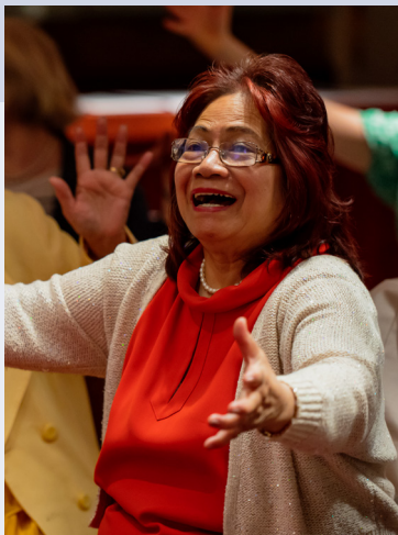
Singing with Friends

As part of the Learning Programme we collaborate closely with the NHS, schools, music education hubs, care homes, social care organisations, the Royal Academy of Music, Solace Woman's Aid and youth justice services in Barking and Dagenham.