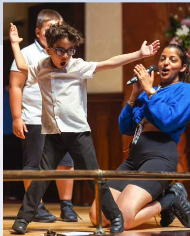
PSP Celebration Day