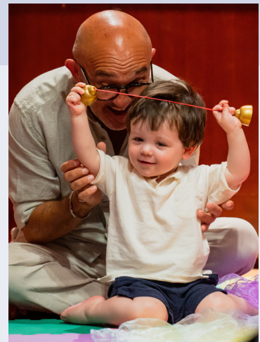
Chamber Tots

‘This was the best week in my entire life. Finding the space and permission to be myself does not come easy. People are often paid to listen to me but don’t actually care. I liked being collaborators and musicians together.’ – Participant from Youth Justice Project